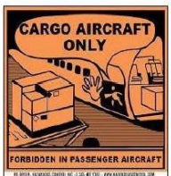
Cargo Air Only Label